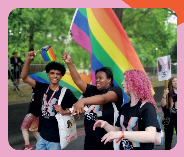
To find out more visit www.brit.croydon.sch.uk