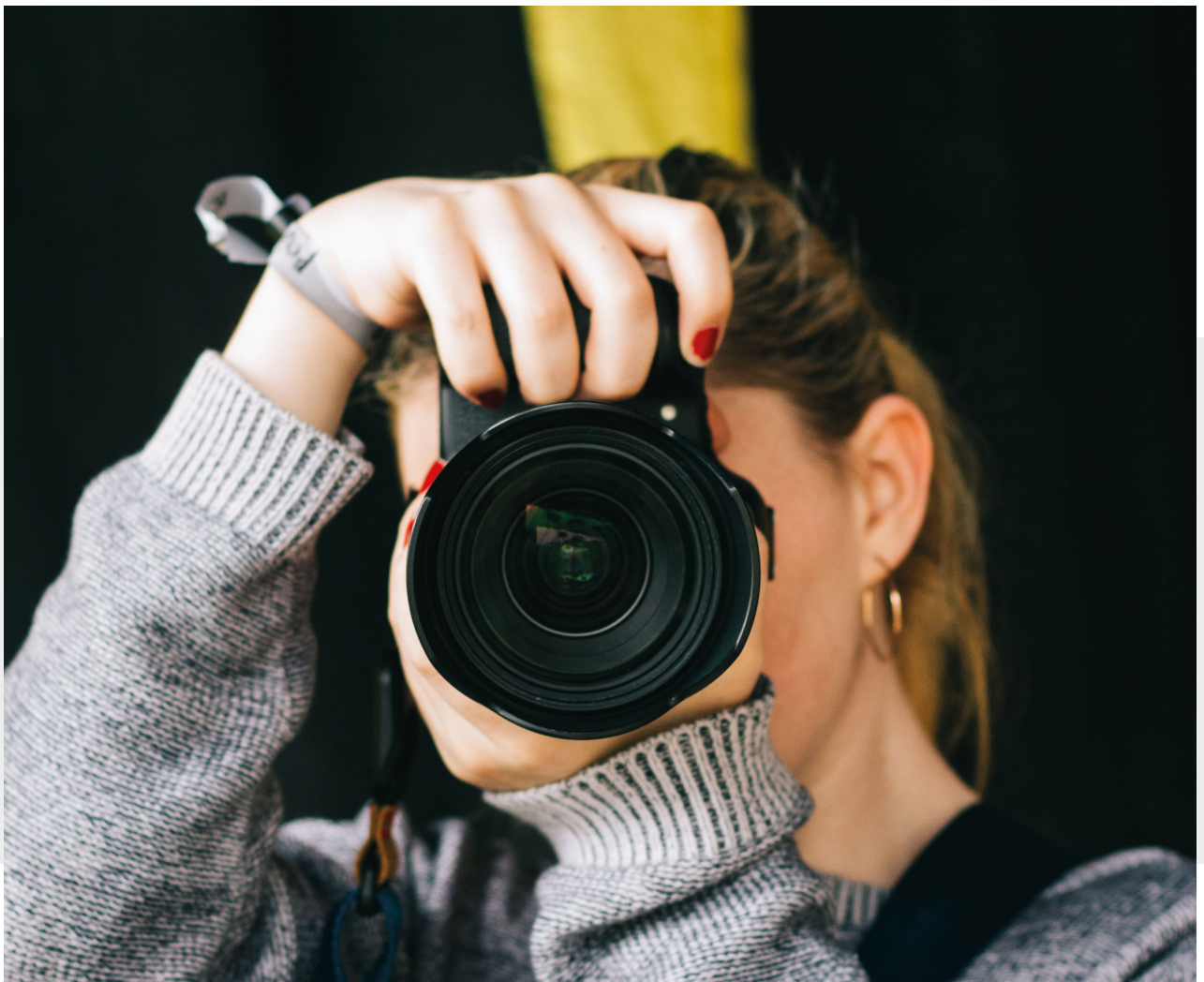
COVER

ecological emergency if we are to limit global warming to 1.5 degrees. In response, The BRIT School has joined artists, music industry professionals and organisations in the UK music industry to declare a climate and ecological emergency as part of Music Declares. Given The BRIT School's leading position as a Performing Arts and Technology School, environmental sustainability is a major opportunity for the School to demonstrate climate leadership and values; define good environmental practice; and benefit from an opportunity to positively and meaningfully engage with our students.